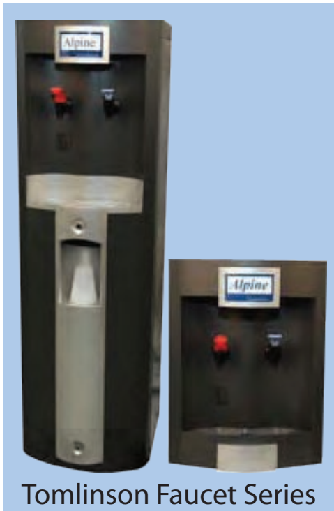
Tomlinson Faucet Series