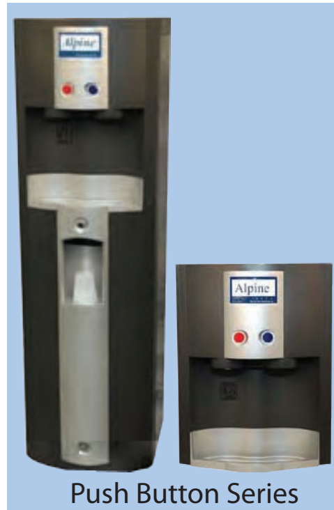
Push Button Series